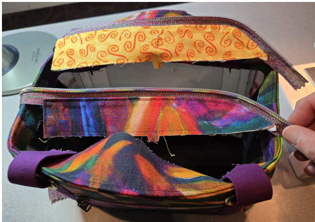
Now, keeping this configuration, flip one Zip Panel UP, so its RST with Facing, aligning single notches. Pin in place at single notch only for now.