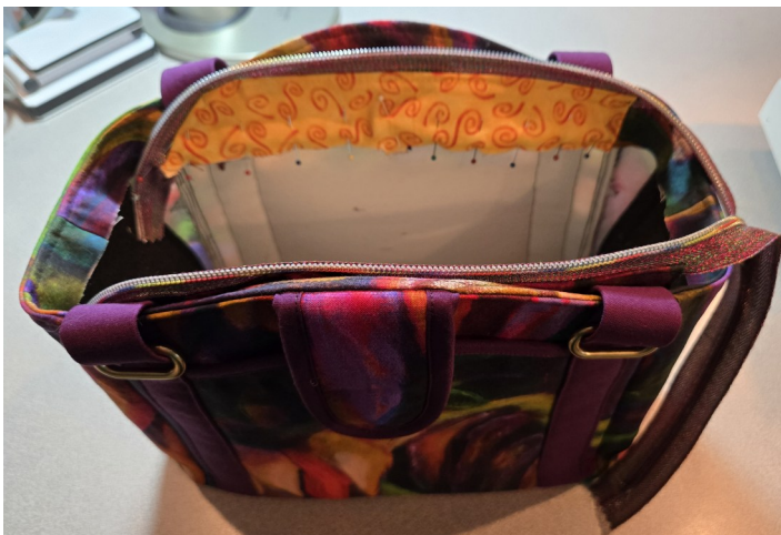
It should look like this when completely attached. Now pull the Facings (with the attached Zip Panels OUT OF BAG for stitching). Then clip off top zipper ends.