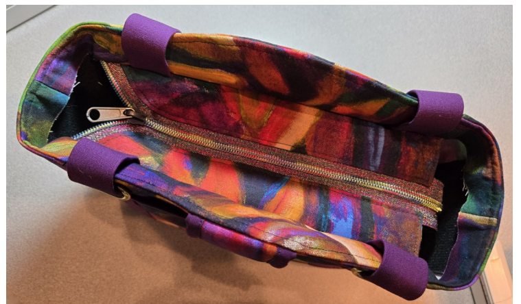
And here's how the Bag Top area should look after stitching and with the Zip Panels pushed down and INTO Bag as they will eventually be when the Bag is complete.