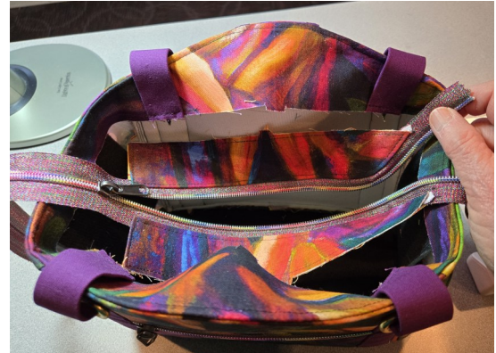
Next, open the zipper