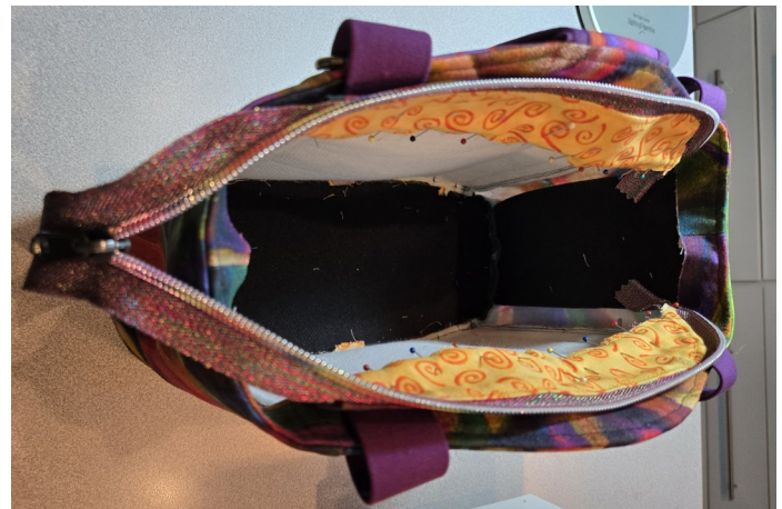
In the same was, flip the opposite Zip Panel UP and RST with that Facing, aligning single notches. Now go ahead and open zipper completely and pin both Facings in place