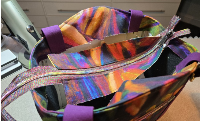
First– Place Zip Panel into Bag as shown above. (Notice that the zipper ends proceed RSU out of Bag)

The purpose of the following pictures is to aid in attaching the Zip Panels WITHOUT ending up with twisted zipper ends