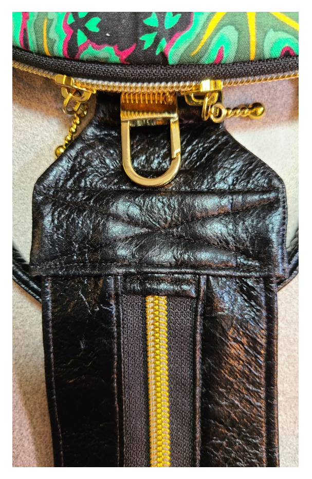
Step 50— Now place your Bag "back-side DOWN' with the top link flipped up & away from Bag. Push your Zipper Panel end inside the remaining Top Link opening (hopefully you didn't stitch this closed either) and then carefully stitch in place as shown!