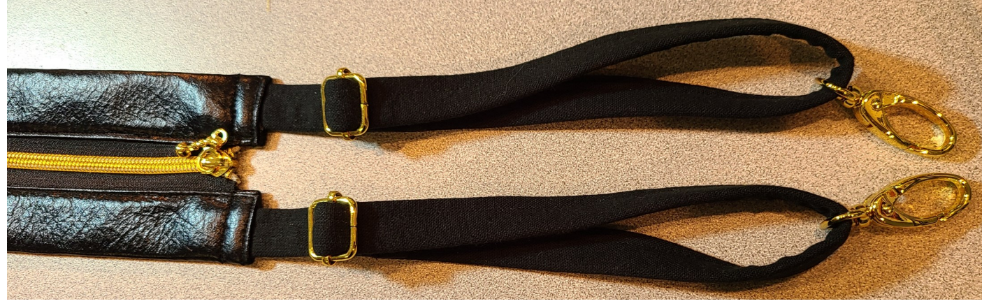
Step 48-49- I hope you didn't stitch these Zipper Panel openings closed! Open them up if you did and stuff a Strap end intoeachopening for about an inch then stitch in place twice! Reinforce this stitching too!