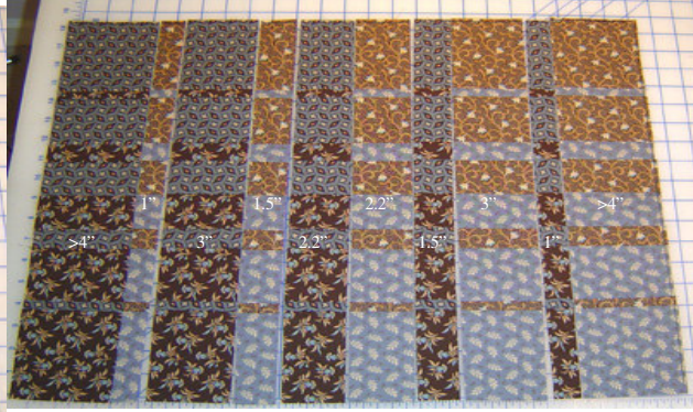
L) As before, merge strips from the Left Unit with the strips from the Right Unit. Start by moving the 1" Left Strip between the 3" and the >4" strips on the Right Unit. Continue merging as shown in the illustration to above.