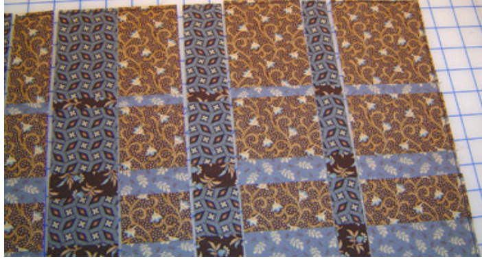
M) Confirm that the strips are all in the right order, and that the orientation lines are all at the top of the unit.