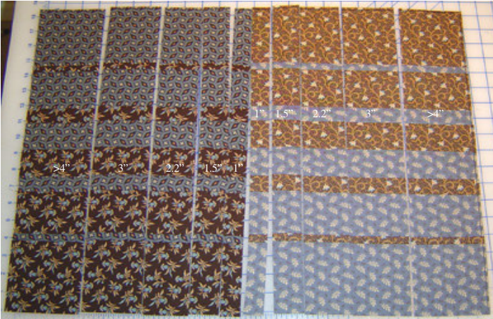
K) Cut strips in the same widths as was done in step F.

you go any further, press the seams on ONE of the halves in the opposite direction. (It doesn't matter which one.)