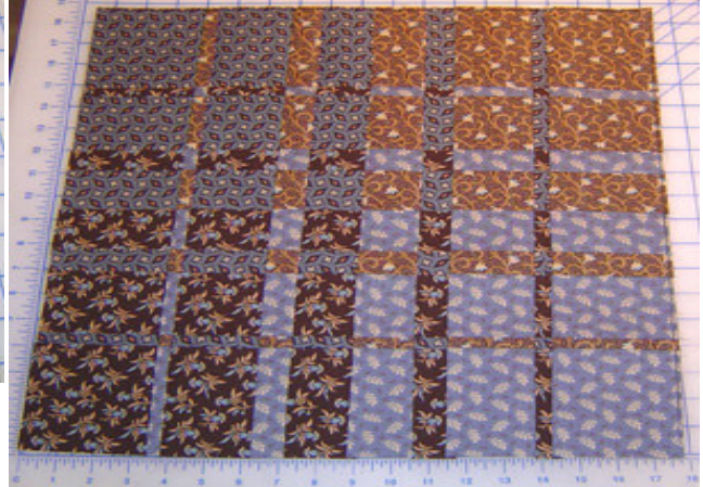
N) Now stitch strips together, as you did in step H, using a 1/4" seam. Press all these seams in one direction. You are DONE!