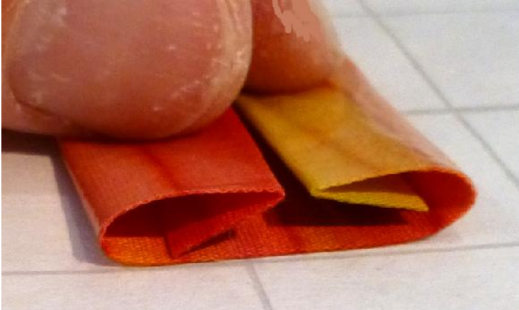
Step 52: Now you can press each Tab in half again (pressed folds together) aligning raw edges. You'll need two finished Tabs for your Purse Insert.

Begin by pressing each long Tab edge over 1/4" WST. Next, fold these pressed edges over (WST) so that they meet in the center of the Tab.