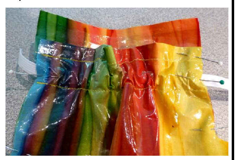
Step 29: Likewise, it's going to be near impossible to gather the bottom edge of this Pouch Pocket as you stitch it in place on the Corner Flat(#3). It's no big deal though. Just pleat the excess fabric along the bottom of the Pouch Pocket toward the outside edges and then stitch in place as directed.

First, stitch 1/2" from the top folded edge of Pouch Pocket(#5), then stitch another line 3/4" below the first, creating the "tube" for your elastic.