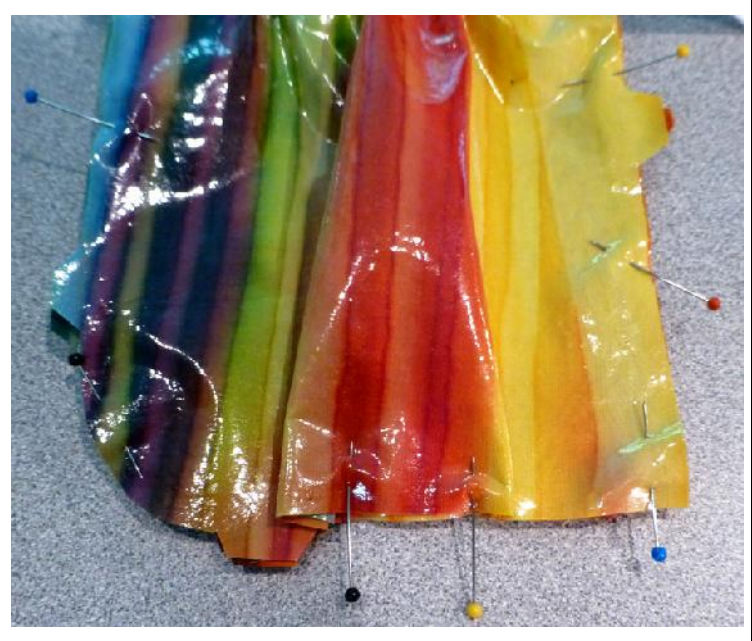
Pleat excess fabric along bottom edge and press each pleat toward outside Pouch Pocket edge.