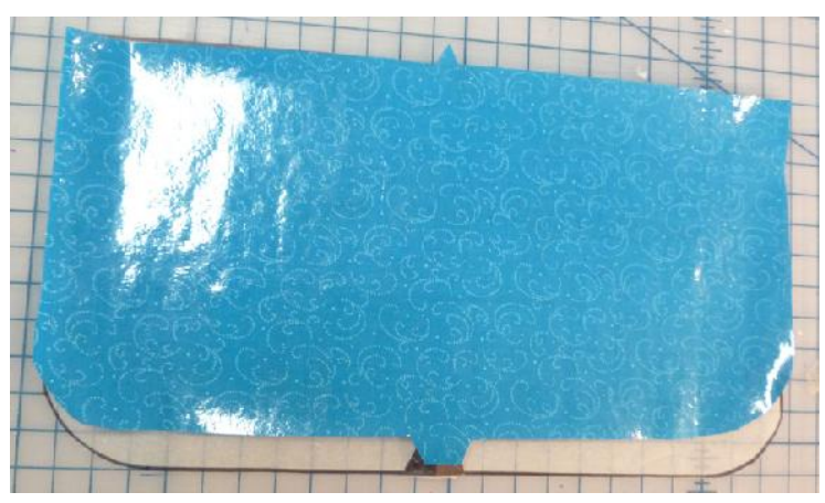
Here's the Zipper Pocket I used laid on top of the actual pattern piece

Zipper Pocket— The only pattern piece that needs to be slightly altered prior to cutting is the Zipper Pocket (#14) (to avoid more bulking issues). I found the units were infinitely easier to stitch together PLUS the bias tape was easier to apply, if the zippered edge of the Zipper Pocket wasn't located as high on the inside of the Insert. (This change really doesn't effect the functionality of the Pocket at all.) Removing about 3/4" from the bottom edge of the Zipper Pocket (#14)pattern piece prior to cutting should resolve this issue for you. (If you prefer to remove 3/4" from the top edge instead, that's fine too, just reposition the notch as you'll need it.)