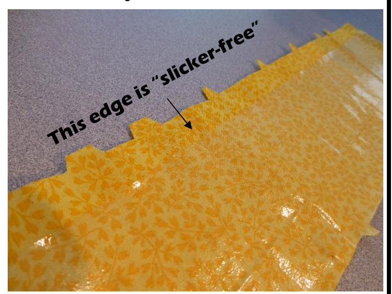
Here you can see how I deliberately cut the CC Holder out so that the left hand side edge is not "slickerfied"

CCHolder— The accordion-like folds in the CC Holder (#12) can really cause some stiffness in the outside seam. I recommend cutting out your CC Holder with the <u>outside</u> edge strategically placed \sim 1/2 " OFF the laminated edge of your fabric. I tried making a sample with an entirely laminated CC Holder, and also as described above, and while my machine handles it both ways, it was definitely easier with the laminated edge set \sim 1/2 " away from the outside fabric edge.