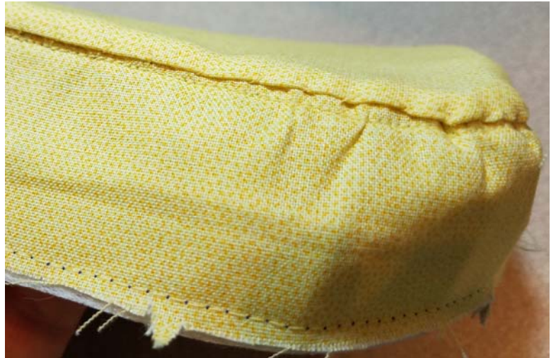
7b) Handstitch in place referring to tip below.

Stitching Tip: Your goal here is to simply conceal the raw edges of the bottom seam w/ Wall, NOT the actual step 3 stitching. This stitching need not be pretty or particularly accurate as it'll be "buried" deep WITHIN the seam, inside your Zip Pouch.