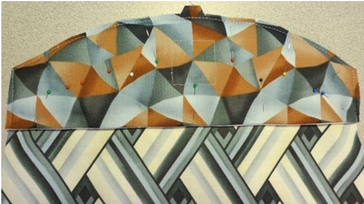
23a) Place UnderFlap S&S side DOWN on RS of Flap Lining. Pin in place & stitch close to ALL 4 edges. (above)