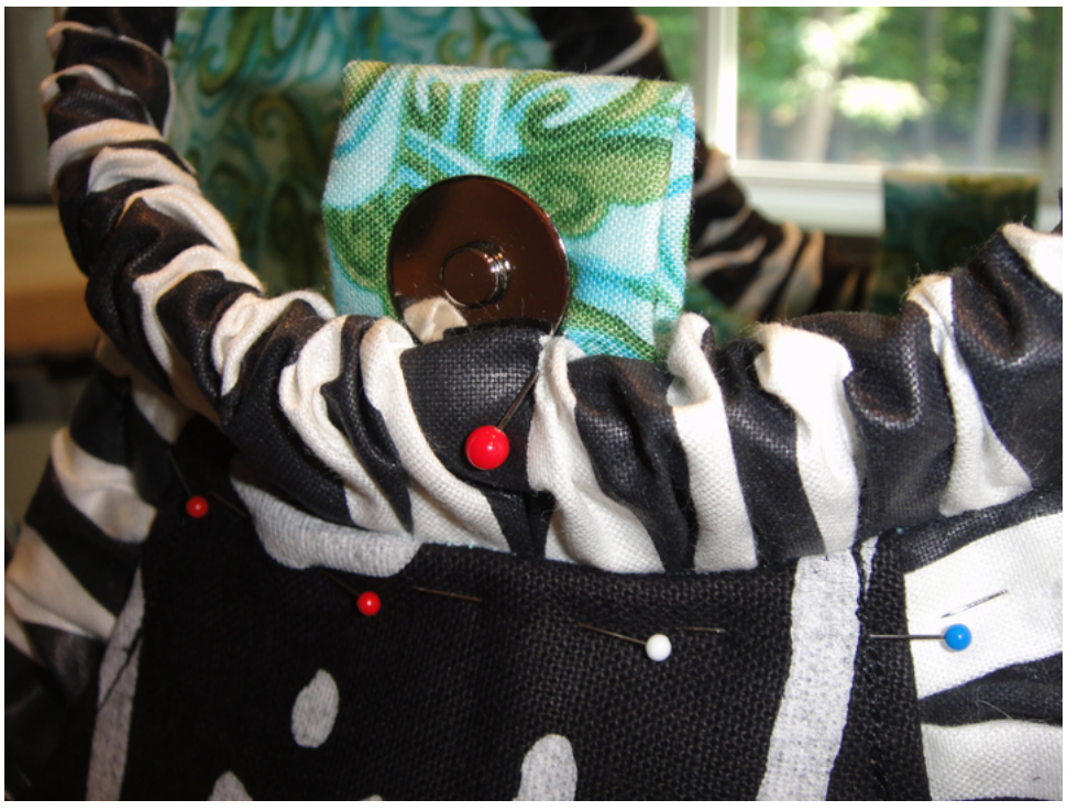
Step 44b– Here's a closeup of the area showing the Snap Tab pinned UP.

Step 44a— To prepare for the topstitching, pin from the bag exterior thru to the lining, to keep the entire area flat. Remember to pin both of your Loops and Snap Tabs UP and away from the stitching area.