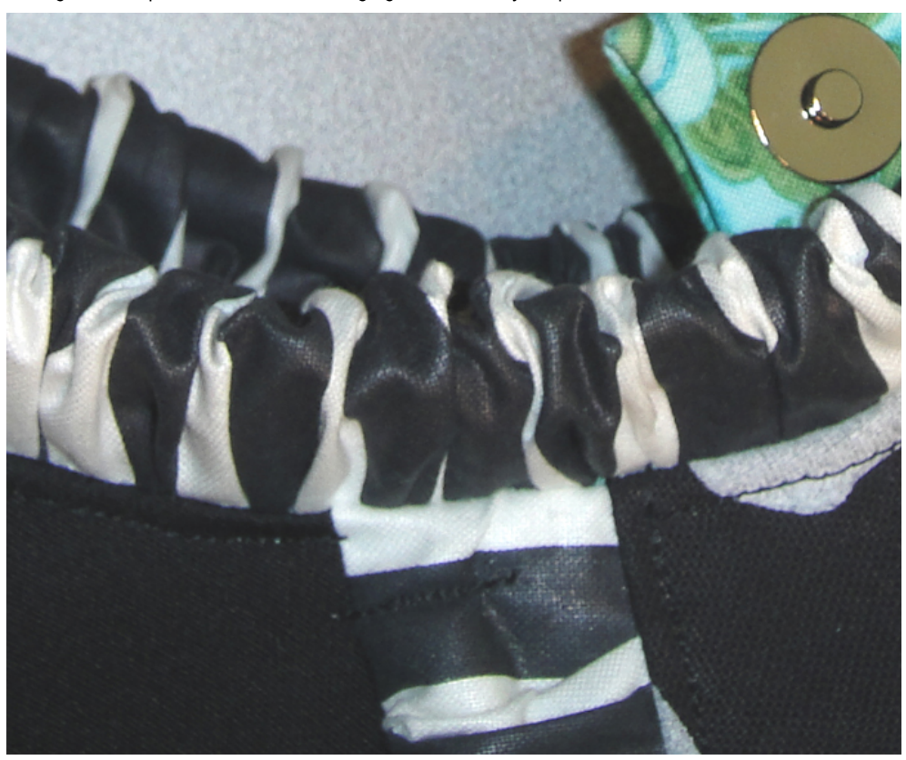
Step 44d— This closeup of the Roo Edging shows how I stopped the topstitching just before the Edging, and started topstitching again just on the other side. :)

COPYRIGHT 2010, STUDIOKAT DESIGNS. The DittyRoo ™ All Rights Reserved. Written Permission is required to copy, and/or distribute copies of this page, whether or not you profit from it. StudioKat Designs, 1-336-416-1799, or toll-free, 1-866-409-8634