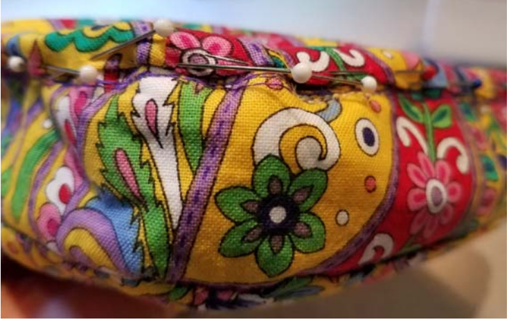
From here, the pinning along the bottom edge of the Zip Pouch is almost identical to what we did in steps 18-19. First, we matched the bottom double notches