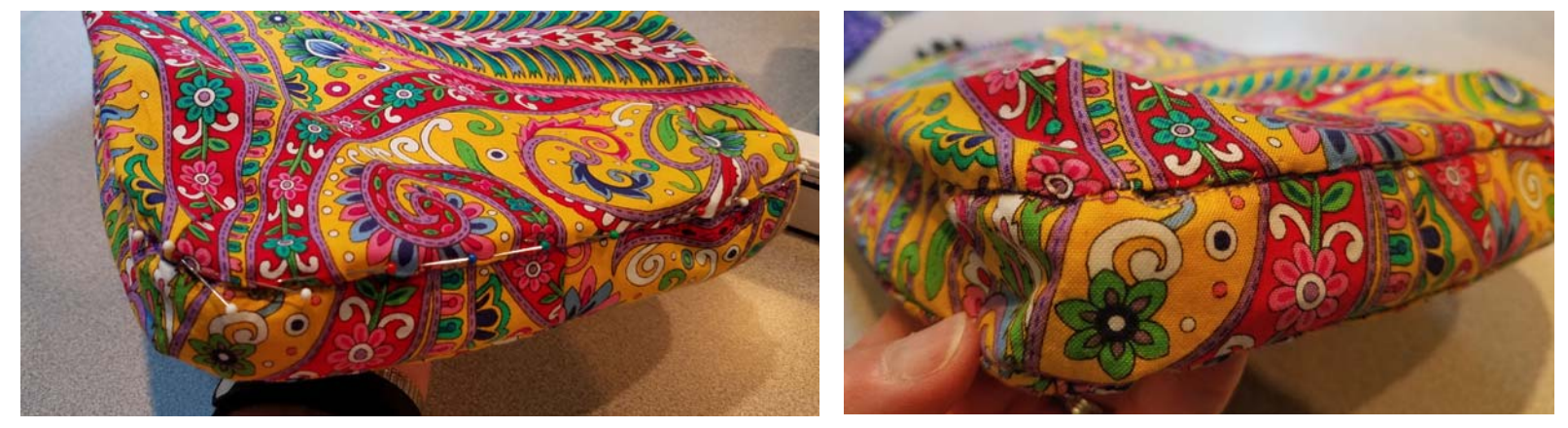
At left- the entire edge is pinned in place.

At right- the entire edge is stitched in place. As you can see once again, this doesn't have to be pretty stitching (and its not!) :)