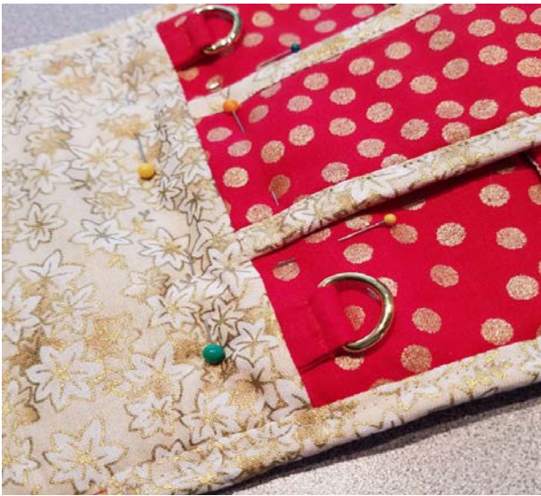
38) Pin Strap Holders & Tab to Bag Exterior to secure in place