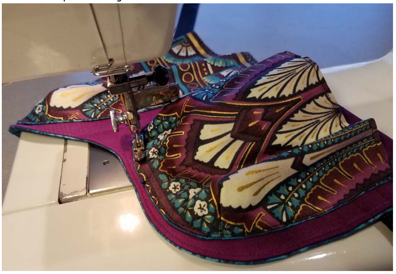
And in these two pictures you can see that we're repeated the procedure in the same way to attach the small Pocket to the Panel.