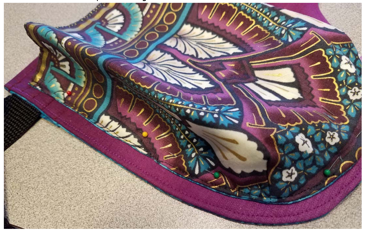
Festival Pocket Belt- Steps 17-18- Page 3