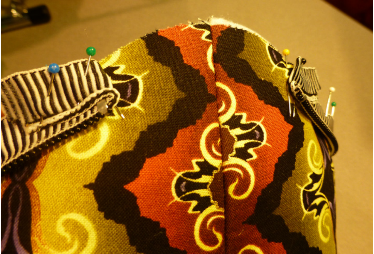
23) Place pressed zipper top edge RST along purse opening. The top metal zipper stop should be place right on the pin placement as shown above.