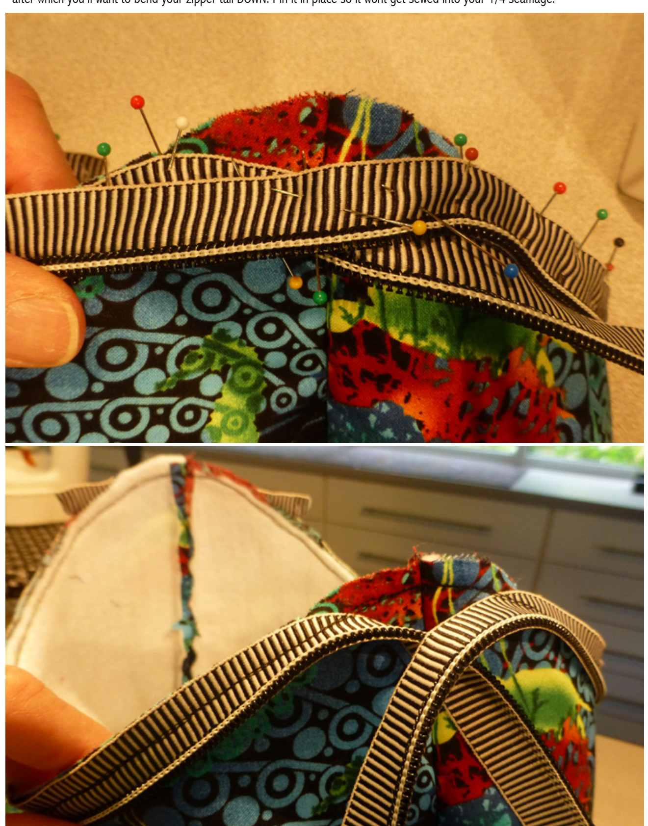
24) Pin other zipper piece in place and stitch 1/4" from raw edges. RESTITCH entire area for security. It should look like this when you're done.

23) Continue pinning zipper RST to bag opening til you get to the 1 1/4" pin placement on opposite Bag corner, after which you'll want to bend your zipper tail DOWN. Pin it in place so it wont get sewed into your 1/4 seamage.