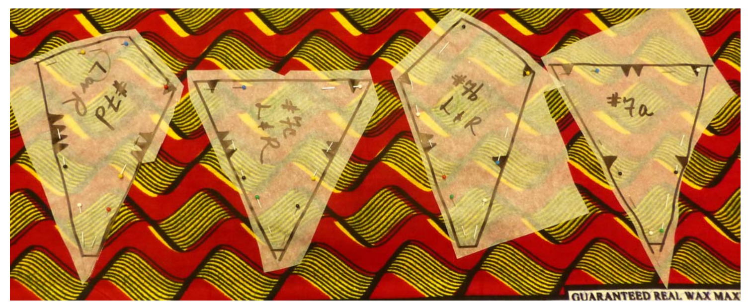
In this picture I have the template pieces for the left side of what will be my pieced Bag Front lined up along the desired design element. As you can see, they are all placed WSD on the right side of the fabric.

Next, I laid out the pieces for what would be the right side of my Bag Front (#7b, #7c, #7d and #7e). BUT--- here's the big difference, for this layout, the ONLY pattern piece that was laid WSD on the right side of the fabric was #7e. Pieces #7b, #7c and #7d were all laid out RSD on the RIGHT side of the fabric!