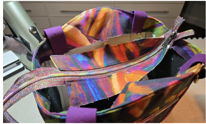
First– Place Zip Panel into Bag as shown above. (Notice that the zipper ends proceed RSU out of Bag)

The purpose of the following pictures is to aid in attaching the Zip Panels WITHOUT ending up with twisted zipper ends