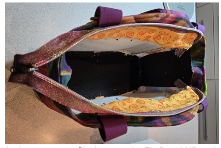
In the same was, flip the opposite Zip Panel UP and RST with that Facing, aligning single notches. Now go ahead and open zipper completely and pin both Facings in place