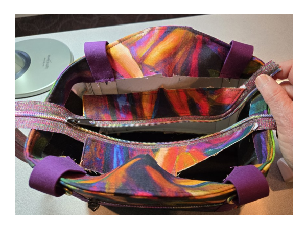
Next, open the zipper