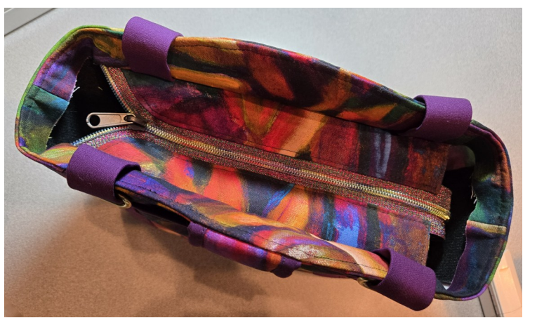
And here's how the Bag Top area should look after stitching and with the Zip Panels pushed down and IN-TO Bag as they will eventually be when the Bag is complete.