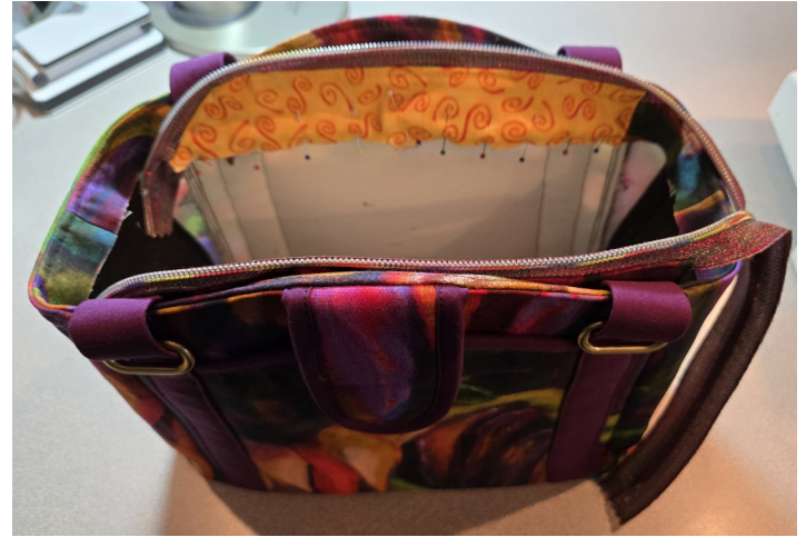
It should look like this when completely attached. Now pull the Facings (with the attached Zip Panels OUT OF BAG for stitching). Then clip off top zipper ends.