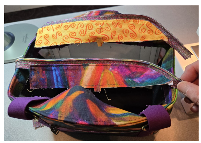
Now, keeping this configuration, flip one Zip Panel UP, so its RST with Facing, aligning single notches. Pin in place at single notch only for now.