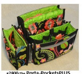
#2800- The Porta-PocketsPLUS Purse Insert