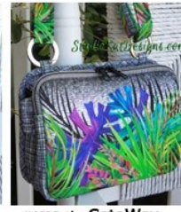
#4600- the GateWay