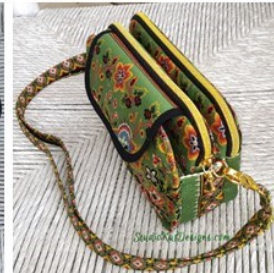
#5500- Double Take