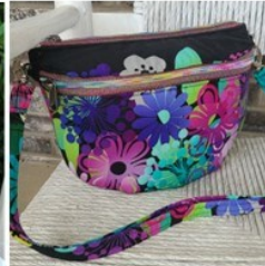
#5700- Tandem DayPack