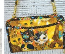
#5600- Easy Go Wallet