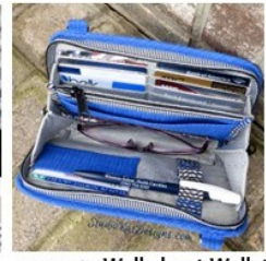
#3700- the Walkabout Wallet