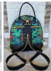
#4800- the OutBreaker