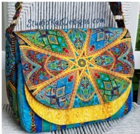
#4100- the Flaptastic