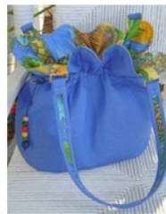
#2100- Boho Baguette