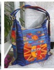
#3200- Cosmo Convertible