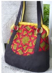
#3600- Triple Play