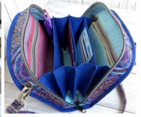
#3800- the Everyday Attache