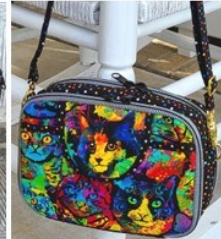
#5200- the Elsie K Baglet