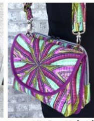
#3400- HipBag Hybrid