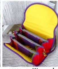
#3300- the Wrapody