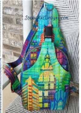
#4300- the Sling Along