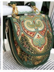
#4100- the Go-Go Compact