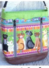
#3100- the Guardian