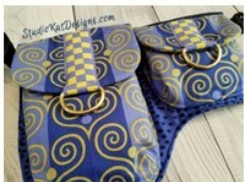
#3900- Festival Pocket Belt