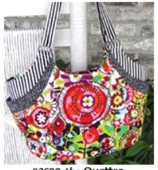
#2600- the Quattro