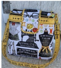
#5300- Bella BiFold