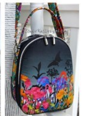
#4500- the Bangle Buddie