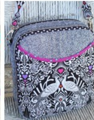
#5100- Gemini FlightBag