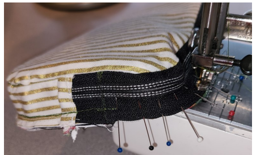
Now you can go back and pin the area you left open in place along the zipper edge and then finish stitching the zipper in place.