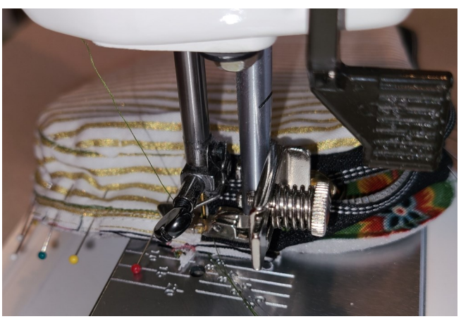
WHY? Because this area will be restitched in the upcoming steps and by doing this you can be sure this stitching will eventually be covered and unseen. :)

BUT- I recommend dropping down & stitching a SCANT 1/4" from the edges thru the zipper/Pouch top area.