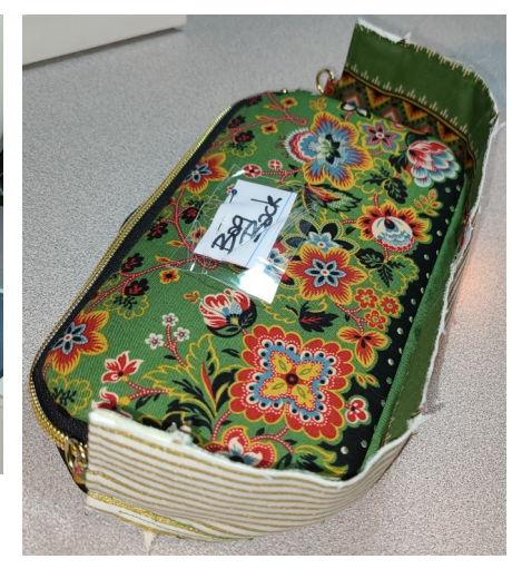
And here's how it looks when its finished.