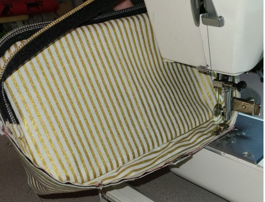
Stitching this Expander in place can honestly be a little awkward so that's why I've included two different shots of how I do so with the whole Pouch standing on its edge. It feels weird doing it this way but it works just fine.