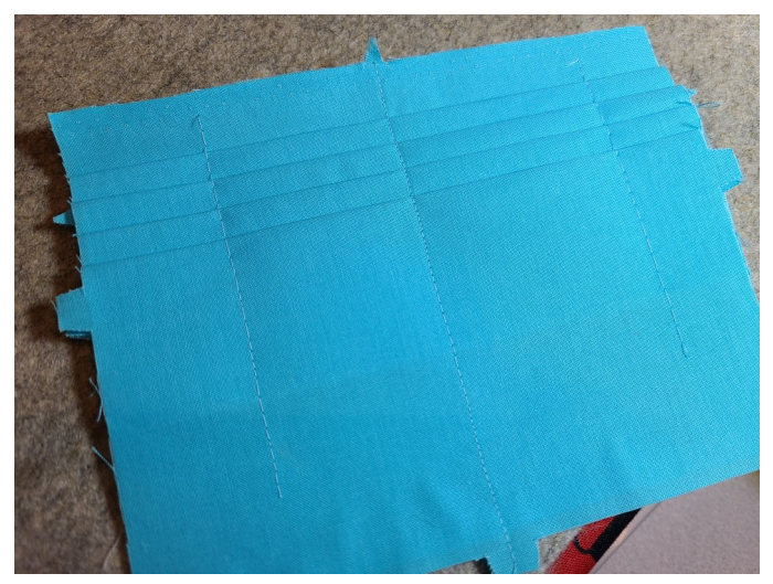
27- Here's the way your folded Caddy should look (both front & back)