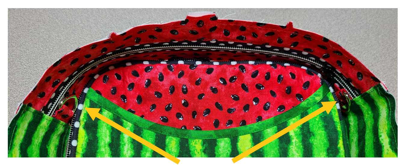
Again, push and place the Wide Panel Unit around your Bag Front so that the D-rings are "first-in.

Clip into edge of Wide Panel unit to stay-stitching at all four Bag corners to aid in easing them in place along the Center Wall edges.