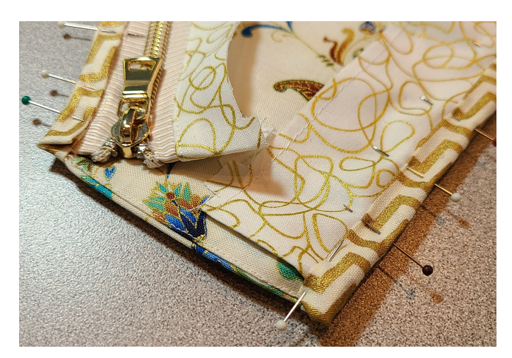
Step 27— Here's a closer view of the pressed over zipper/Wall top area as well as the bias taping.

And below— the Tech Wall is fully attached and now let's attach the Tech Pocket itself. (on page 2)