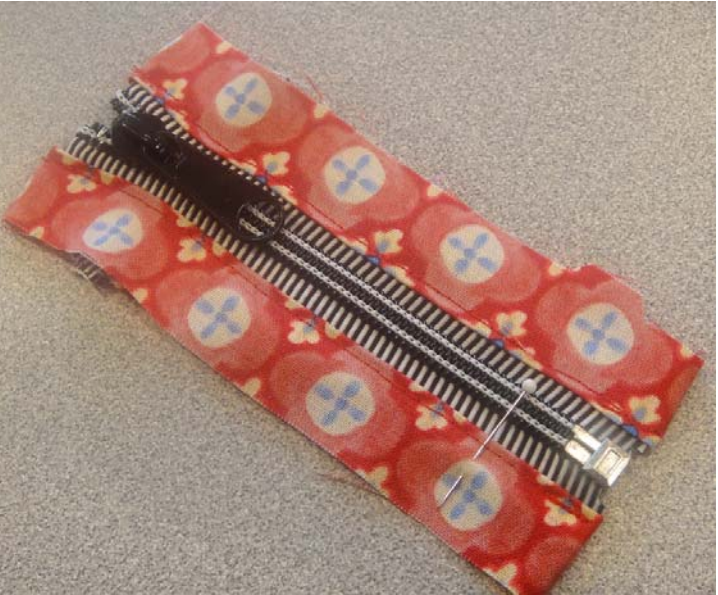
And here's a completed Insert Connector. We'll need a total of four to complete our cover look.

Here's how our ZipWrap on the flip side (wrong side of zipper). See how you can see a bit of the pressed zipper top edge peeking out? Once it's stitch in place, I like to snip off some of this extra zipper tape to keep it out of the Insert seamage, but snip carefully!