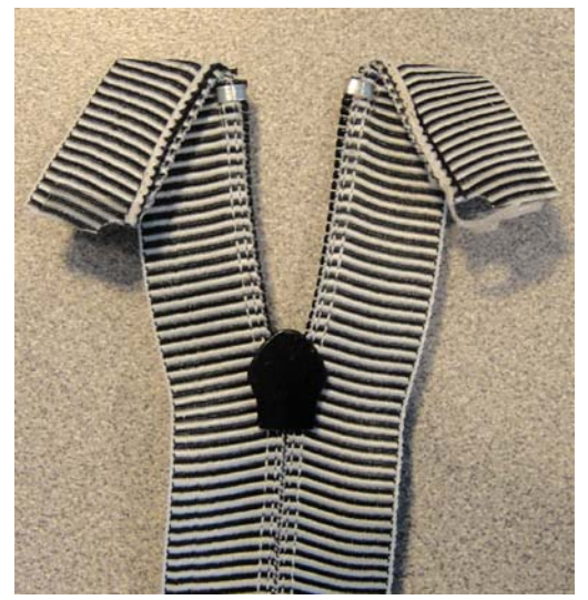
Press both zipper ends back just above the top zipper stop. (Notice that they are pressed back on a slight angle, this will be important later.)