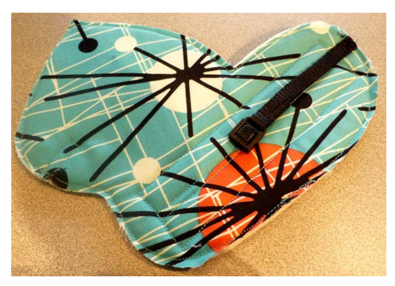
Step 4) Place 6" webbing end (with button release side facing UP) where indicated and stitch in place at fabric edge ONLY for now.