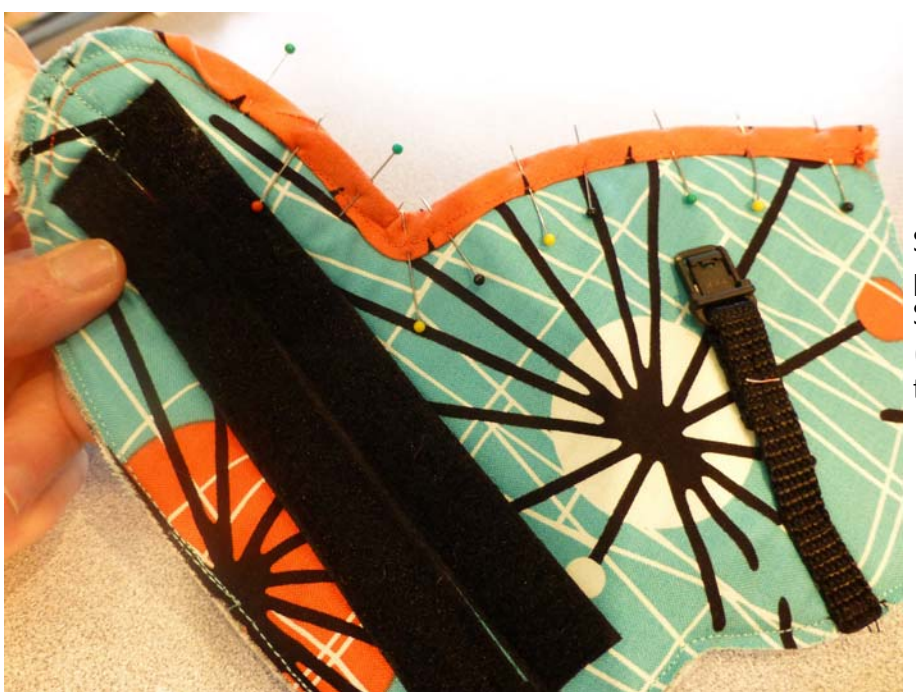
Step 8) Begin flipping bias tape over raw edges, pinning it in place on underside of Holster.Stitch in place on underside of Holster.(At most, you should only be bias-taping up to the 6" piece of webbing at this point.)