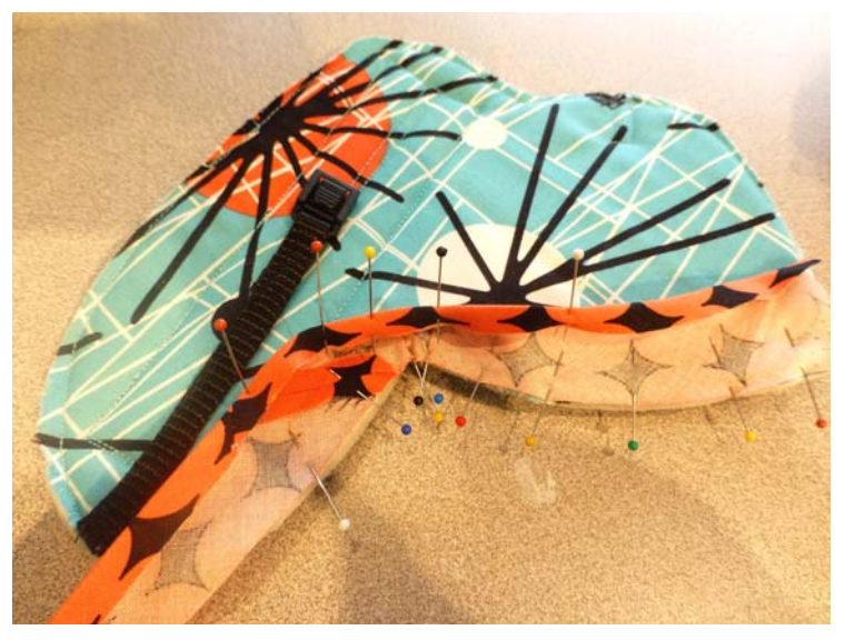
Step 7) Cut a 20" piece of bias tape. Press one folded edge open and flat. With inner side of Holster facing UP, pin pressed edge of bias tape in place RST along Holster edges. It can be a lttle tricky applying the bias tape around the corner, so I included a closeup (at right).