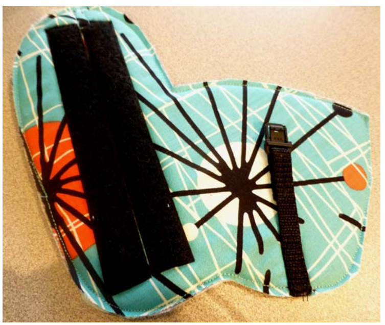
Step 6) Place 4" webbing end where indicated on underside of Holster. Verify that buckle engages correctly with button-release portion of buckle, then secure placement by stitching 1" inward from fabric edge on both sides of webbing.