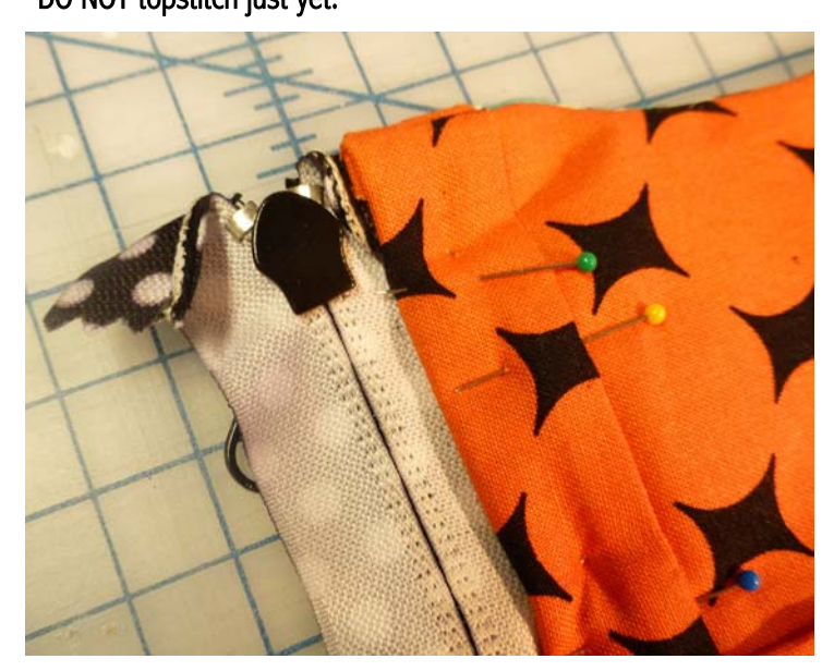
Step 17a) Here's how it should look on the lining side when the zipper is inserted and pinned in place.