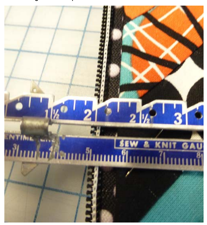
Step 17b) You'll want to have about 1/4" of zipper edge extending beyond the pressed edges of your CC Holder as shown.