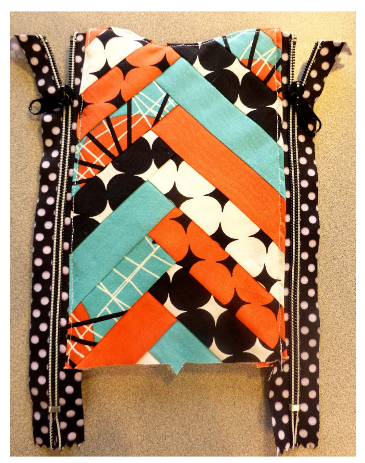
Step 17c) Once your happy with the placement of your zippers, carefully stitch close to fabric edge on both sides of CC Holder AND along top edge. (Make sure you catch the underlying lining in this stitching too!)