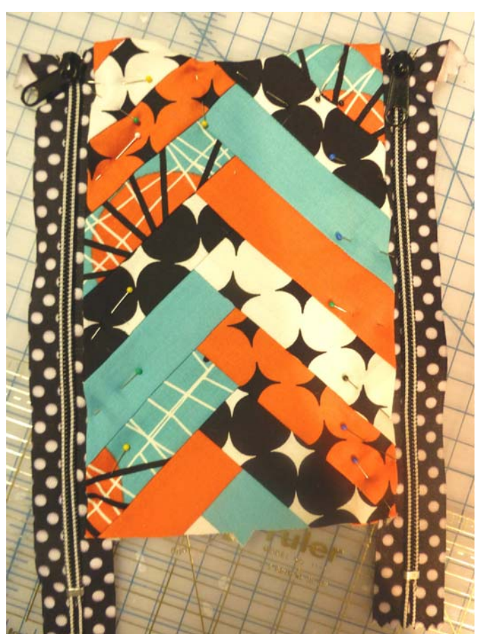
Step 17) After pressing over the top edges of your 2 zippers, insert a zipper in between each set of pressed CC Holder edges. Pin in place.