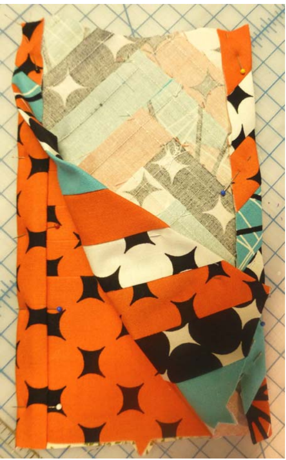
Step 15) After pressing over the long side edges of your CC Holder in exterior 5/8" (wrong —sides together), align the top curved edges with those of your CC Holder in muslin. Stitch 1/4" from edges, then clip curve, trim seam, flip over top edge and press flat. DO NOT topstitch just yet.