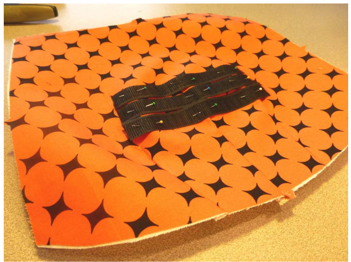
For Concealed Carry ONLY — Place 3 strips of Velcro on the right side of the lining, just above the darts. Stitch them securely in place.